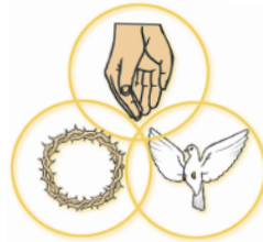
Some Symbols of The Holy Trinity

What is a Volunteer A person who performs or offers to perform a service voluntarily. A person who works without pay or assumes an obligation to which he or she is not a party or otherwise interested.